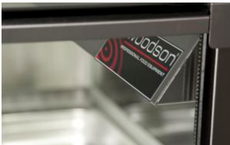
Fully sealed toughened glass for added hygiene