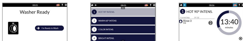
XControl FLEX PLUS approach, program, and cycle screens