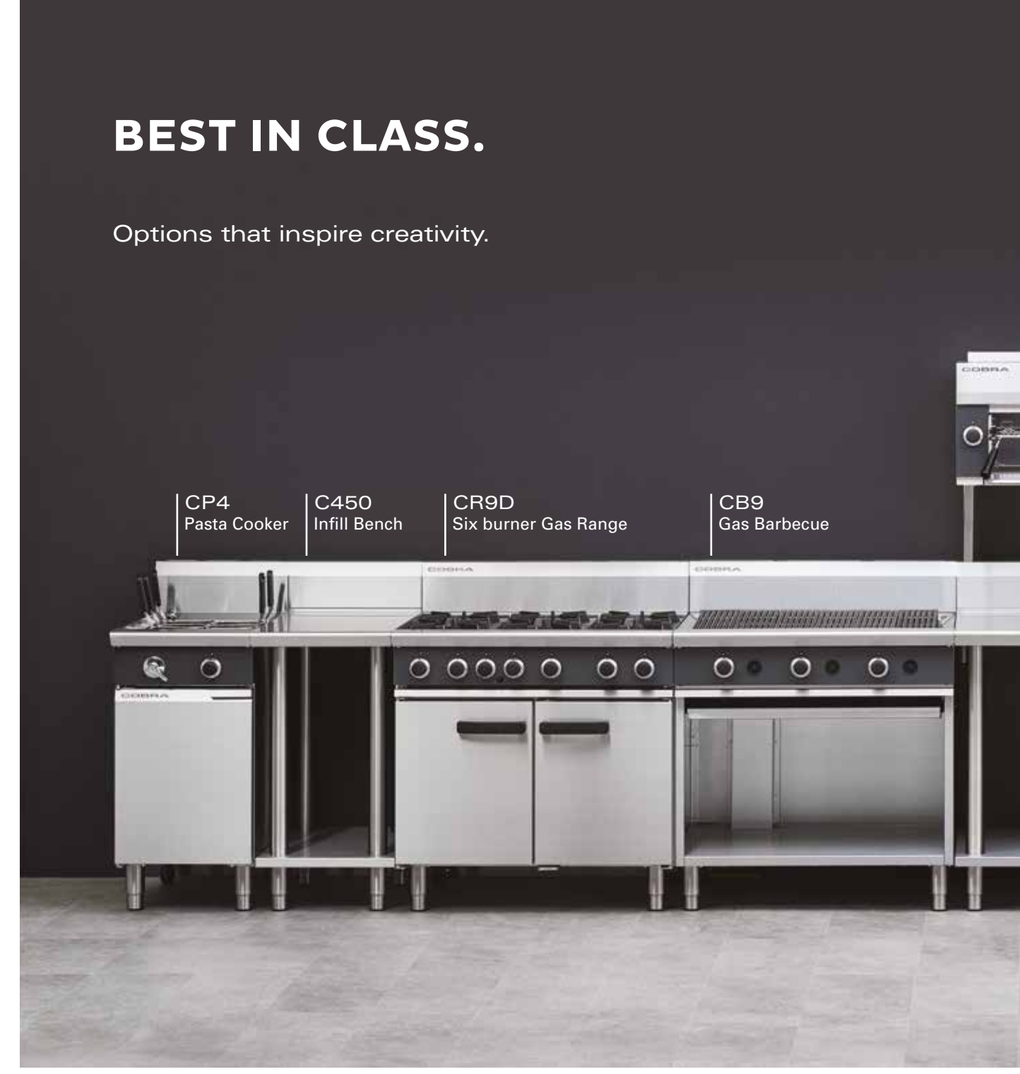
A SUGGESTED À LA CARTE RESTAURANT LINEUP