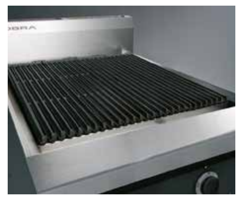
GRATES CAN BE USED FLAT OR TILTED.

Make a lasting impression with the cast iron grates with this heavy-duty barbecue. Used in either a flat or tilted position, they've got the ideal grate edge to produce a branded finish for visual appeal and taste.