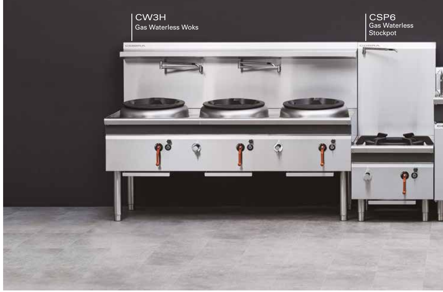
A SUGGESTED ASIAN RESTAURANT LINEUP