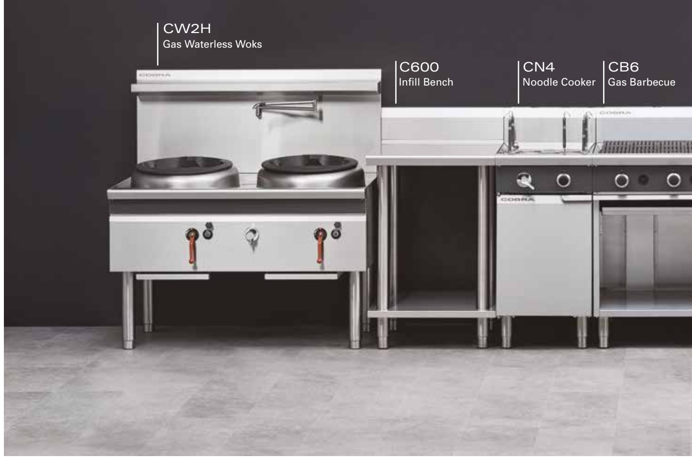
A SUGGESTED FUSION RESTAURANT LINEUP