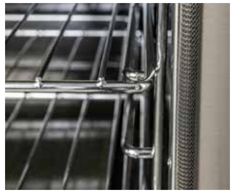
TOP: THE 900MM WIDE COBRA OVEN RANGE FEATURES A FULL WIDTH OVEN WITH GENEROUS CROWN HEIGHT AND SPACE SAVING FRENCH DOORS. ABOVE: NEW STAINLESS STEEL BRAIDED DOOR SEAL FOR BETTER HEAT RETENTION.

As the centrepiece of any kitchen the oven range needs to be a durable, dependable and adaptable workhorse. The Cobra oven range has a generous gastronorm capacity, with standard 2/1 GN or two 1/1 GN pans (900mm) and one 1/1 GN pan (600mm) on each rack. Side hinged door (600mm) and french doors (900mm) give full width access. The high crown height means this oven can consistently deliver any volume required.