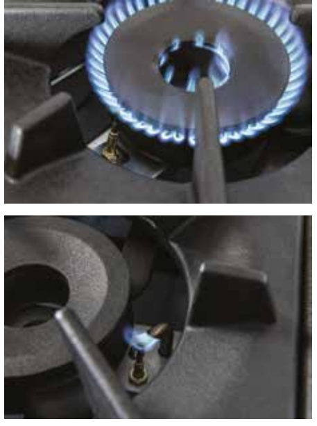
22MJ OPEN BURNER SYSTEM DELIVERING FLAME FAILURE AS STANDARD. OPTIONAL FLAME FAILURE AND STANDING PILOT.

The Cobra gas cooktop has been designed to meet every standard the busy kitchen demands. The cooktop is mounted on a cabinet base offering convenient storage. The simple lift-out 22MJ rated open burner provides exceptional performance and easy cleaning. Flame failure is standard with optional flame failure and standing pilot. The cast iron burners and trivets are finished to the highest quality in vitreous enamel for great looking durability.