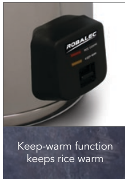
Keep-warm function keeps rice warm