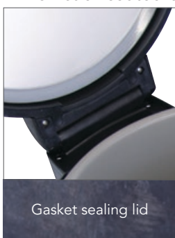
Gasket sealing lid