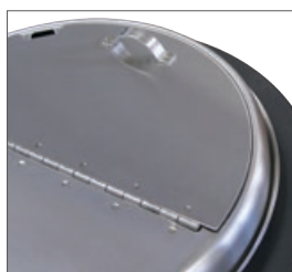
Hinged lid for stirring and serving