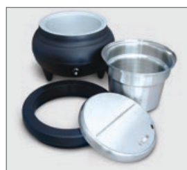
Can be taken apart for easy cleaning