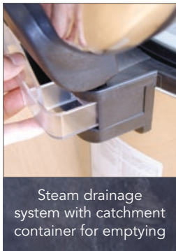
Steam drainage system with catchment container for emptying