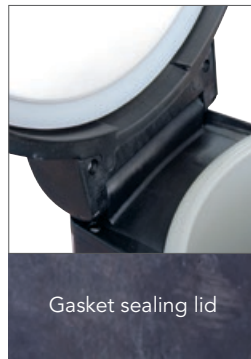
Gasket sealing lid