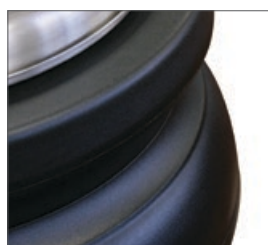
Glass filled nylon outer casing for reduced heat transfer