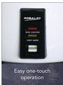
Easy one-touch operation