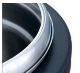
Specially designed rim to allow condensation to go back into soup