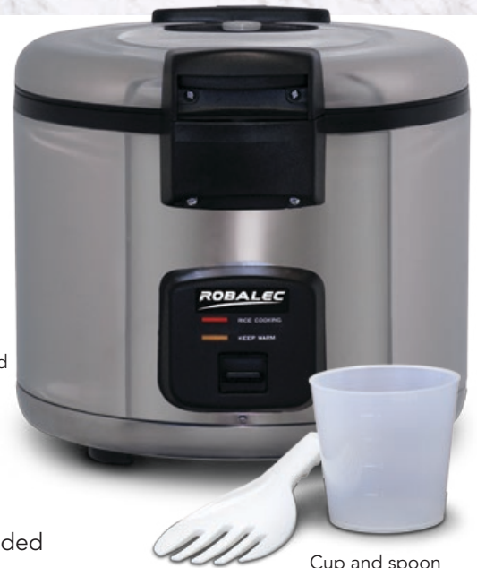
Cup and spoon included