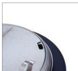
Opening to accommodate ladle while lid closed