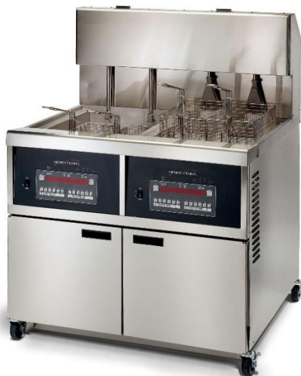
OGA 342 2-well large capacity auto lift gas open fryer

Henny Penny open fryers offer high-volume frying with programmable operation, oil management functions and fast, easy filtration.