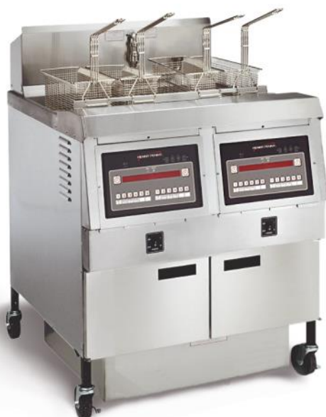
OFG 322 2-well gas open fryer with Computron™ 8000 control

OFG 321 1-well gas OFG 322 2-well gas OFG 323 3-well gas