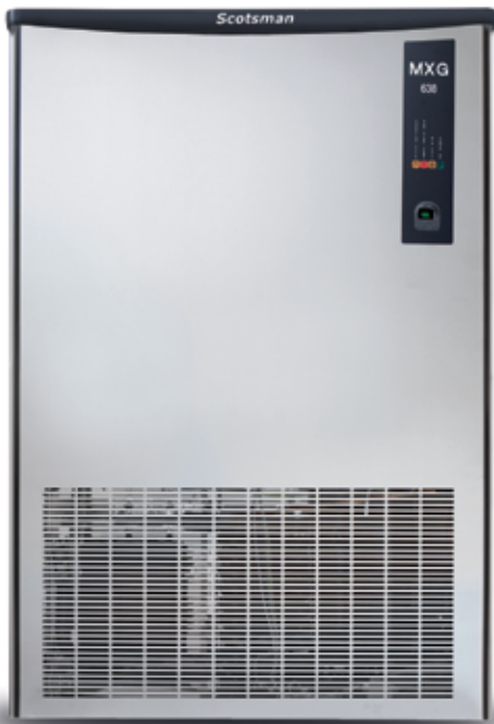
Medium gourmet cube 20g, 30mm dia x H 34mm