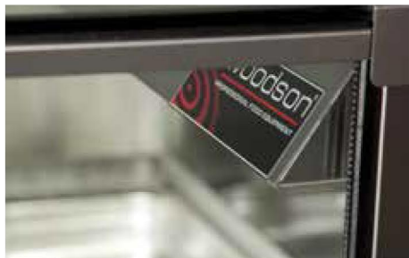
Fully sealed toughened glass for added hygiene