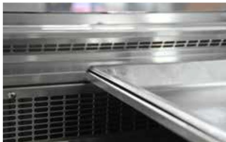
Cool air is blown above and below produce