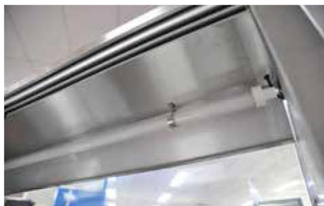
Top mounted fluorescent lighting