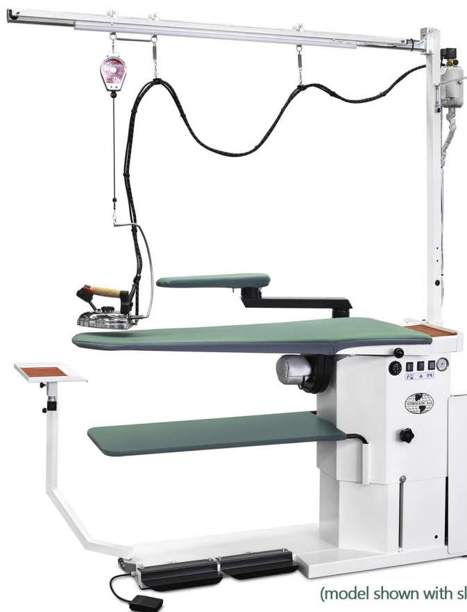
(model shown with sliding trolley, balancer and lighting)