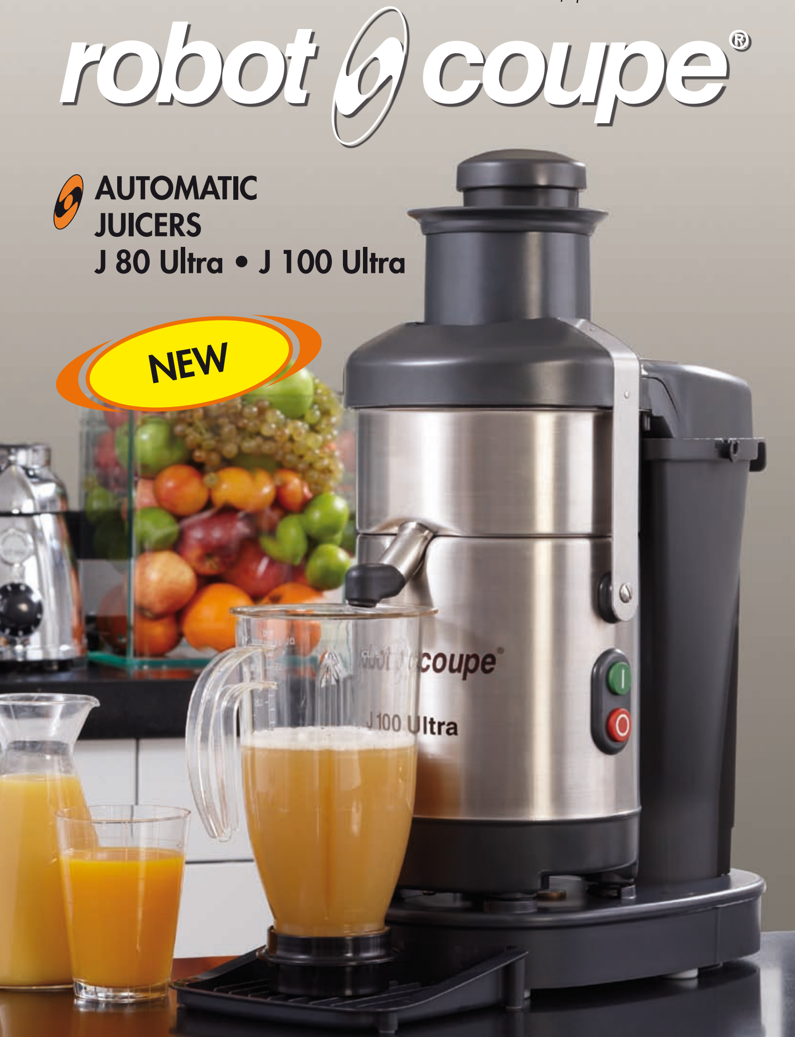
BARS - TAKEAWAY OUTLETS - RESTAURANTS - HOTELS - CANTEENS