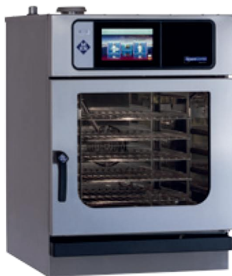
• SpaceCombi Junior MP capacity 6 x GN 2/3