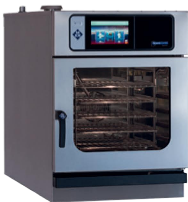
• SpaceCombi Compact MP capacity 6 x GN 1/1