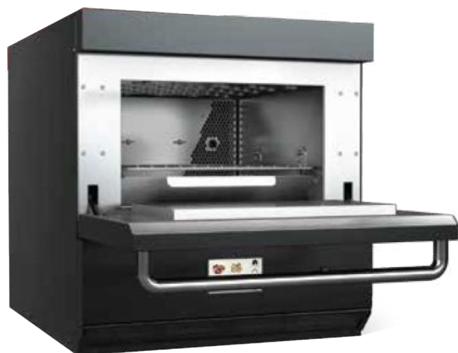
Overall Unit size : W520 x D689 x H613 (mm)

Get the confidence that comes from serving your customers with the highest possible food quality at a fraction of the time, every time.