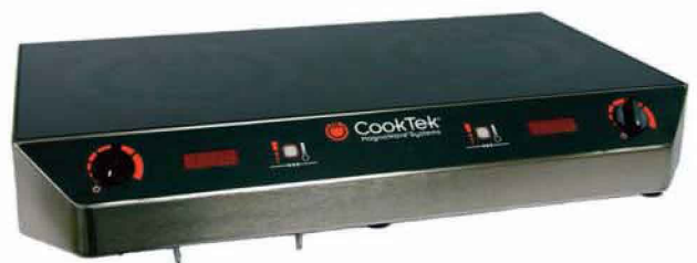
Counter-top double hob