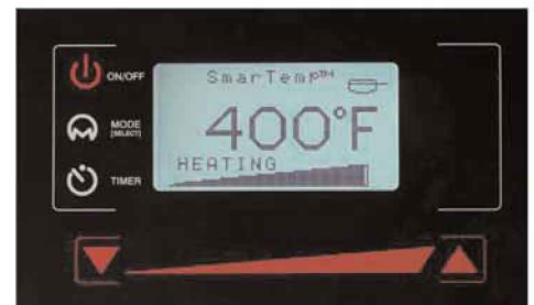
Apogee faceplate shown in temperature mode