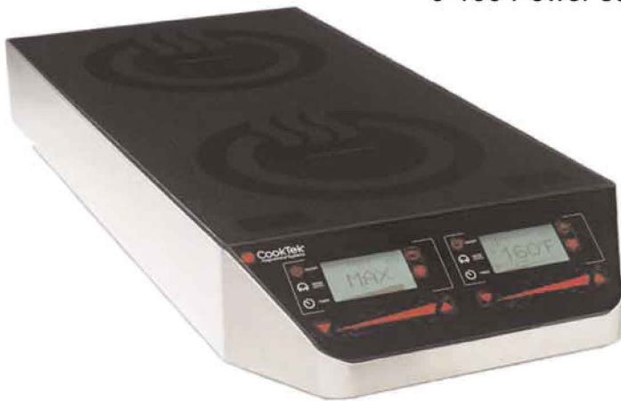
Counter-top double hob