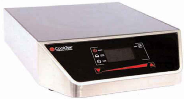
Counter-top single hob

The front panel is made of smooth, easy to clean wipe down tempered glass - no knobs or buttons to lose or break. Beautiful, bright, black and white backlit LCD information center display shows: power setting or target temperature; heating or at-temp status; the timer (when in use); and a pan indicator to confirm that an induction compatible pan is present.