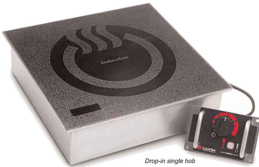
Drop-in single hob

“Heritage” units feature a simple, traditional control knob and display, while “Apogee™” units offer more refinement and sophistication.