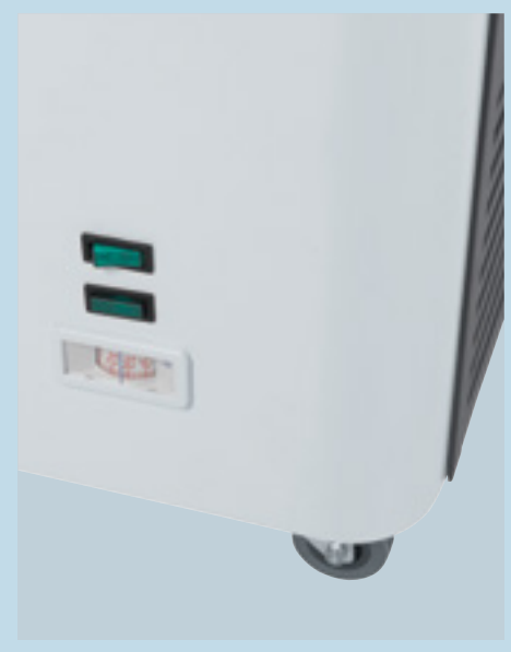
Smooth-running, double swivel castors with 50 mm wheel diameter are used for excellent manoeuvrability. The stable castors are individually screw-fitted and can be changed without difficulty.