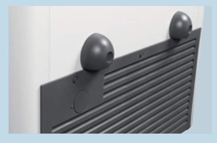
Rubber bumpers can be fixed to provide better ventilation when freezers are placed next to each other and to avoid damage during moving.