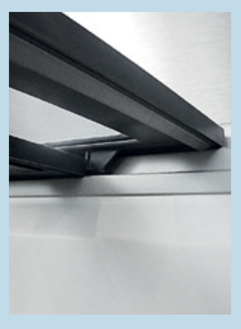
The improved glass lid has a special lid-stopper as an anti-pinch device.