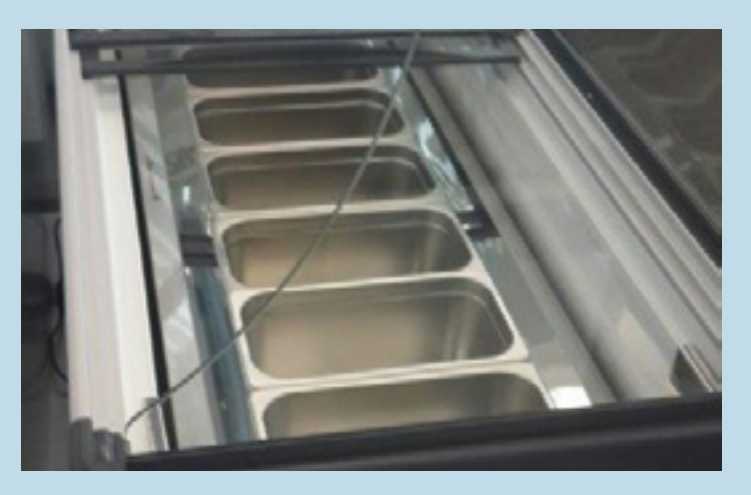
Insert to hold gelato tubs available to suit models EFE 3502 and EFE 5002.