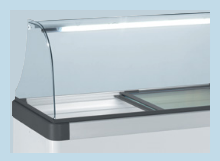
For chest freezers EFE 3502 and EFE 5002, an attractive glass canopy with integrated light is available. This glass canopy offers a perfect solution to showcase fine ice creams.