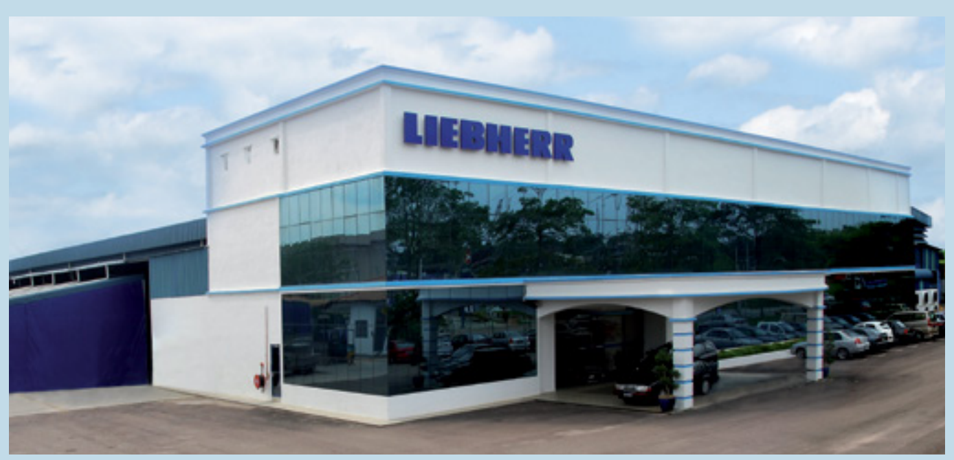
Liebherr Appliances Kluang Sdn Bhd, Malaysia

Established in 1949 by Hans Liebherr with beginnings in construction equipment, Liebherr is a family-owned company that is accomplished in numerous fields. The great success of its first mobile, easy-toassemble and affordable tower crane was the foundation on which the company flourished. Today, Liebherr is not only one of the world's leading manufacturers of construction machinery, but it is also a recognized supplier of many technically innovative, user-oriented products and services. For more than 6 decades, the business grew into what is today, a group of companies employing a workforce about 38,000 in more than 130 companies on all continents.