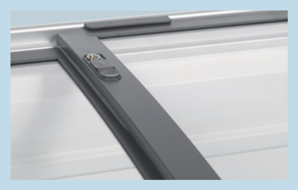
The entire range of chest freezers comes with a lid lock to secure access to frozen goods when needed.