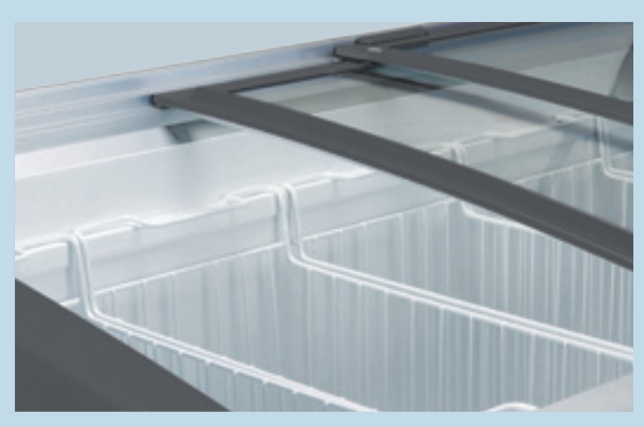
Suspended baskets fitted to all models to clearly present and display goods.