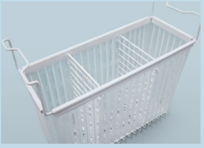
Easy clip-on protection set for the different shape and size of baskets to avoid damages on cones or edges.