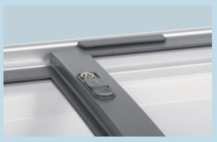
Lid locks fitted to all models to protect goods inside from unauthorised access.