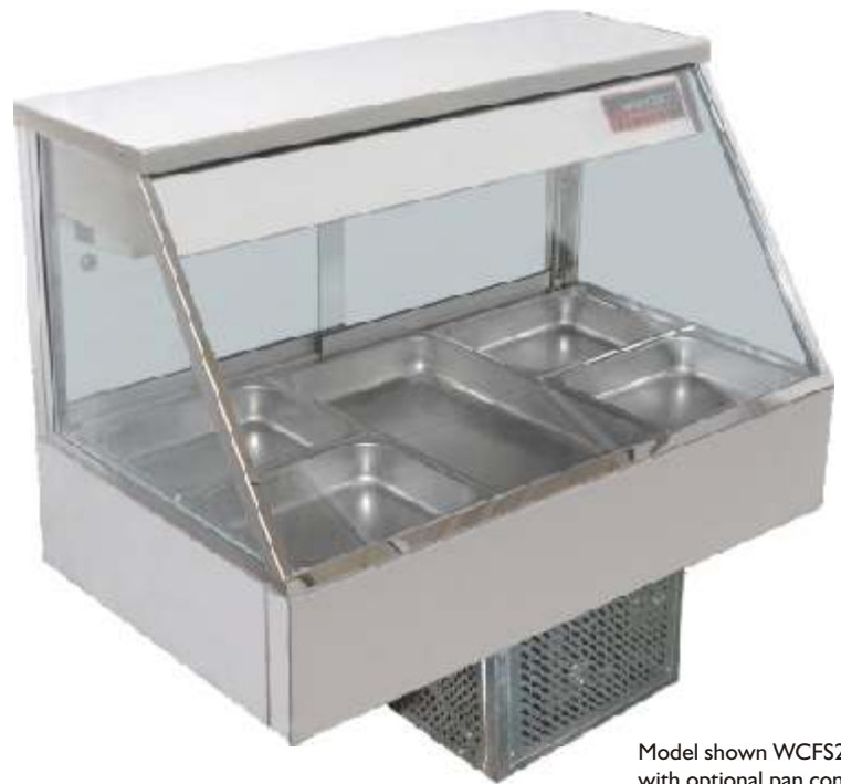
Model shown WCFS23 with optional pan combination

www.TotalCommercialEquipment.com.au 08 8363 5282