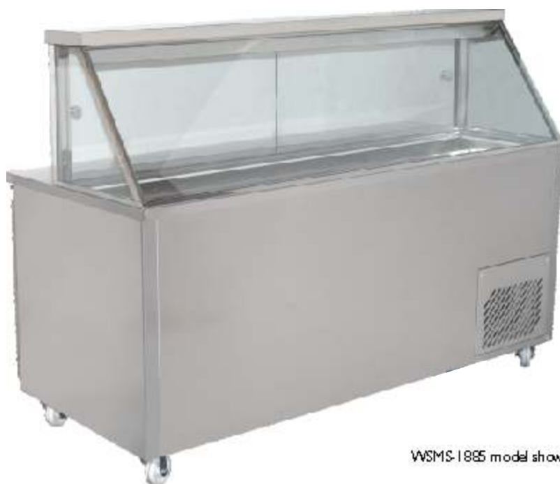
WSMS-1885 model shown